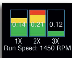
Display on vibrometer unit. Analyze.