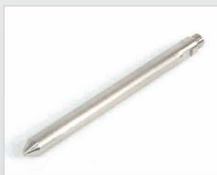
Stinger, Part No. 03-1326