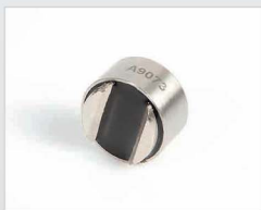
Magnet, Part No. 03-1327