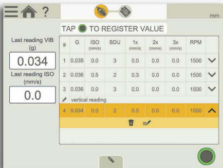
The XT280 connects to the XT Alignment App, making it possible to document the result as PDF, with photo and comments for each measurement point.